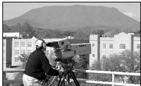
Two VMI football games will be carried throughout the Mid-Atlantic on Comcast SportsNet.

The popular pre-home game tailgate show sponsored by the Keydet Club last season is slated to return this fall. Airtime is one hour before kickoff